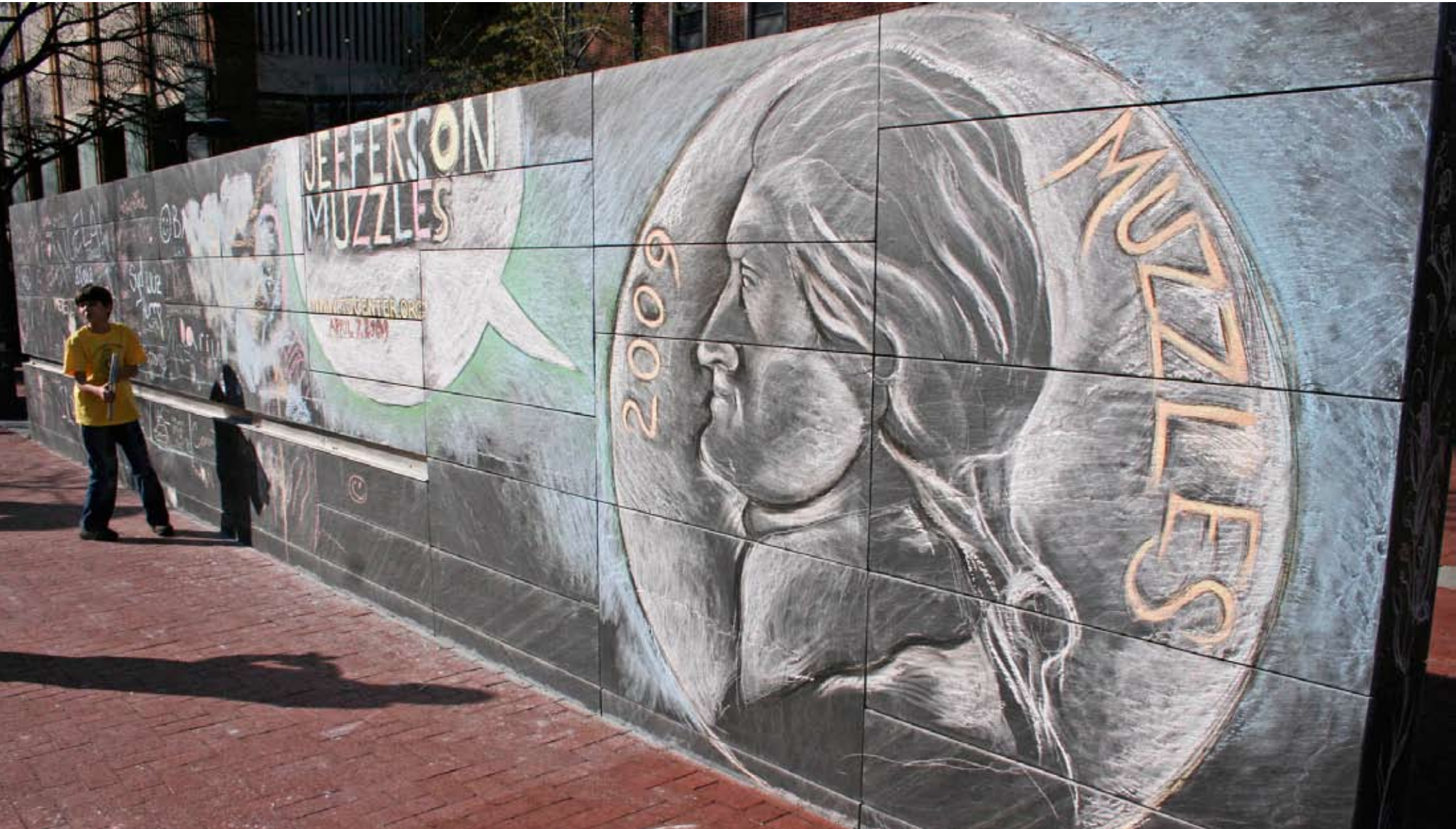
Jefferson Muzzles Award artwork on Chalkboard