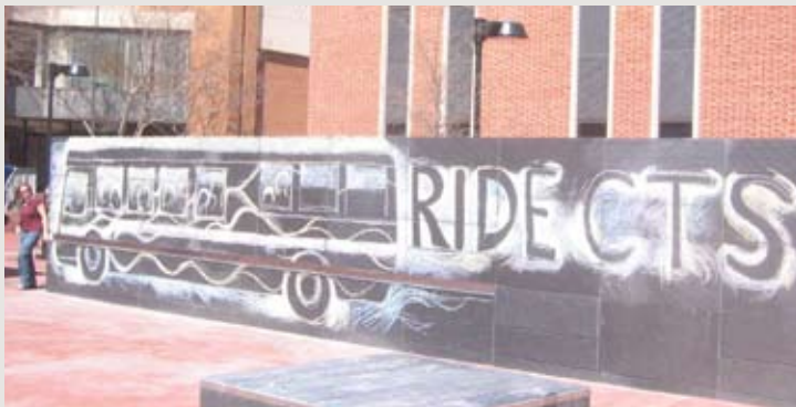
Chalkboard image to promote transit