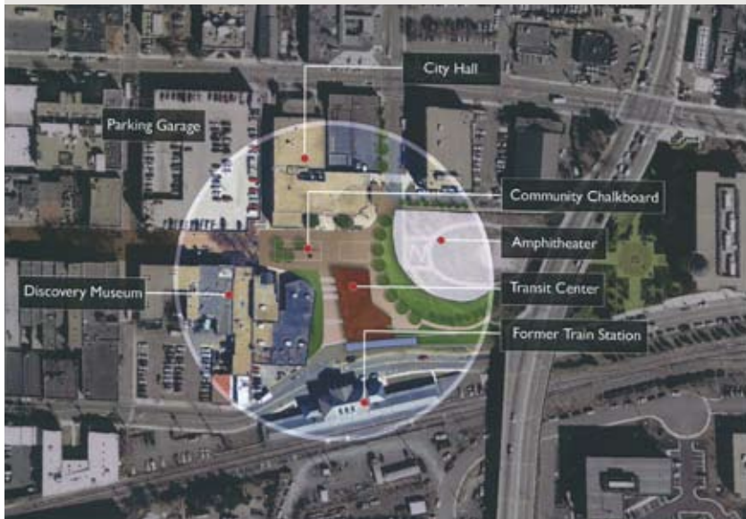
Diagram of Chalkboard location in plaza

The Chalkboard is oriented in an east-west direction on the central axis of the Mall, so that people walk by one side or the other when traversing the space. People passing in and out of City Hall, the Visitor Center, Transit Center, or simply cutting through the public space, pass directly by the Chalkboard. Similarly, when there are events at the Charlottesville Pavilion, hundreds of people queue up