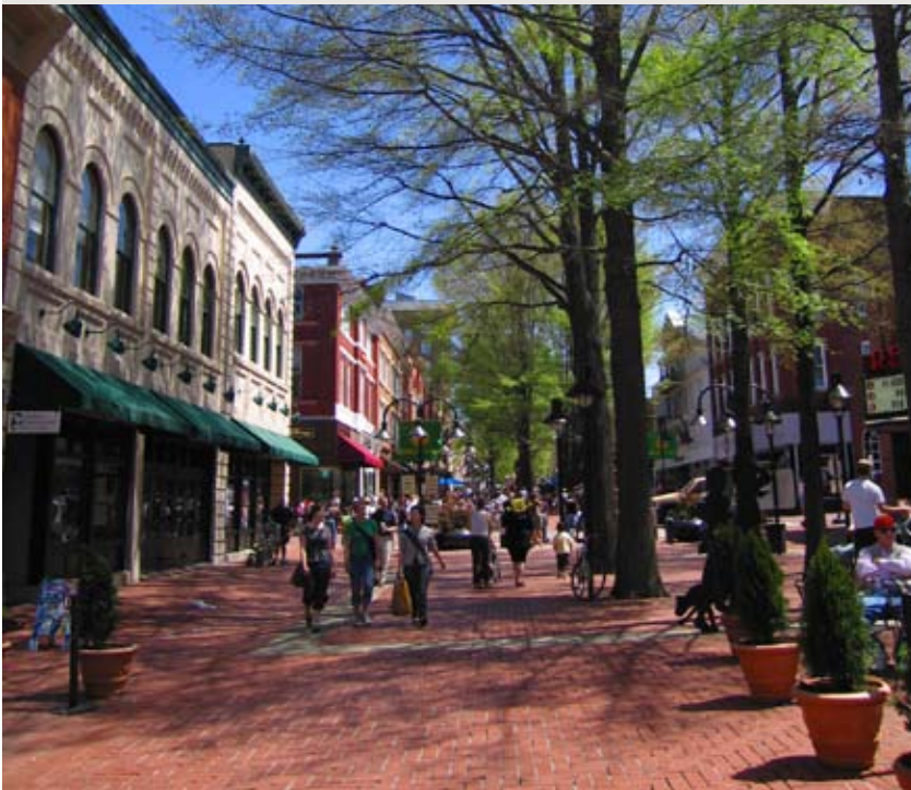
View of Downtown Mall