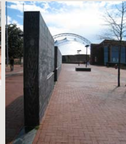
Views of Chalkboard from plaza