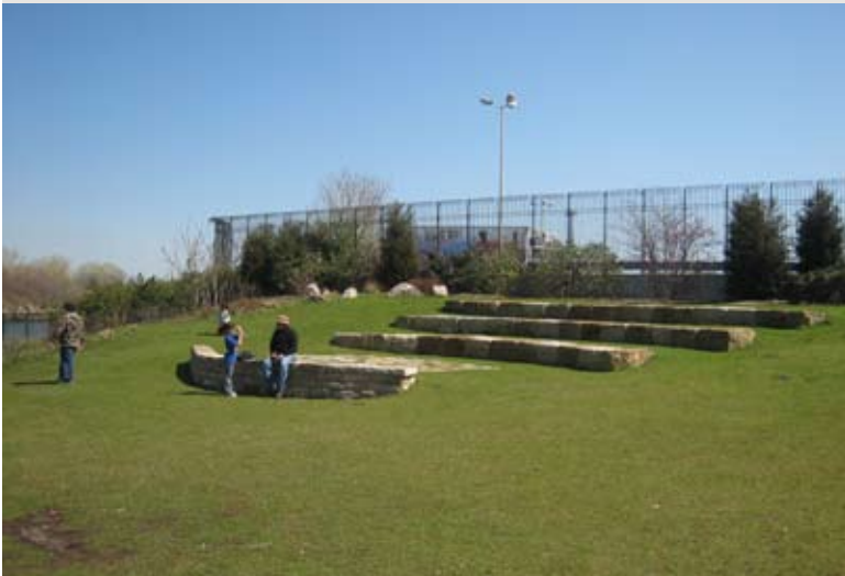
Amphitheater at Hunts Point