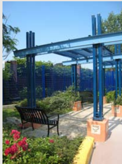
Views of playground, dock, and trellised seating area

The Bronx River flows on the east side of the Park. A gravel ramp and a dock provide access to the water. This area of the river is tidal, serving barges and recreational boats. The south side of the Park is