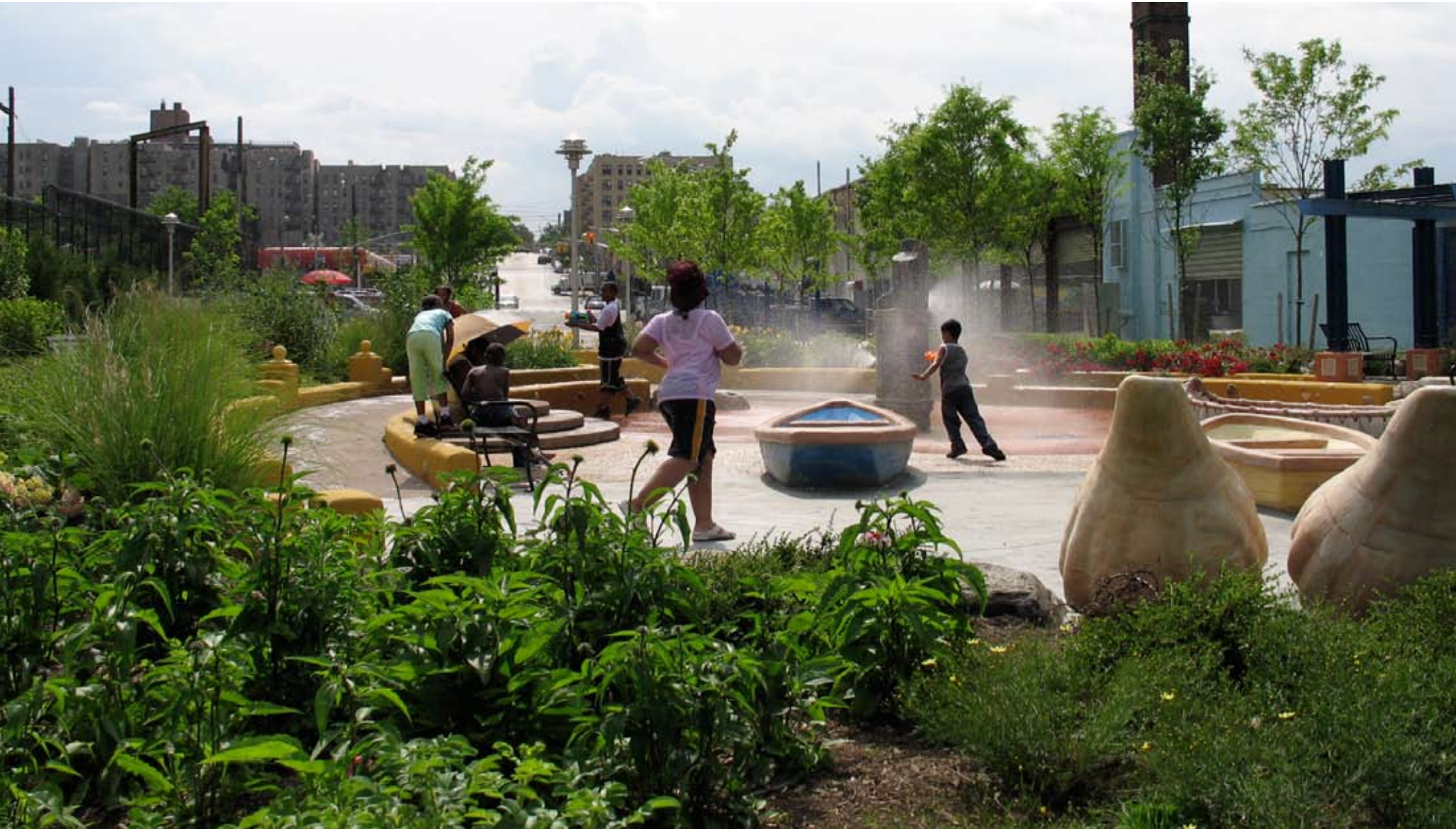
Neighborhood children in Hunts Point playground