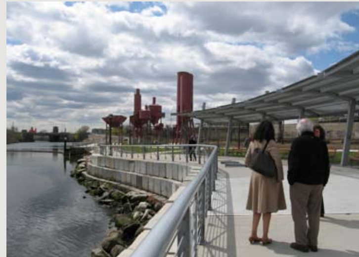
Views of Cement Park near Hunts Point

season. It has also become a site for festivals and special events such as Majora Carter’s wedding and the starting of The Point’s annual Fish Parade. It stands out as a lush, green space amidst industrial neighbors. When the wholesale market closes in mid-afternoon, the park creates a presence on a street that is otherwise largely empty. The Park’s place in the community and the process used in bringing it about seem to have had an impact on its immediate neighbors, most obviously seen in the environmentally-conscious elements added at the scrap yard site. And, without the Park, it is unlikely that the neighboring brownfield “fur factory” space would have been acquired, remediated and developed as the José E. Serrano Riverside Campus for Arts and the Environment.