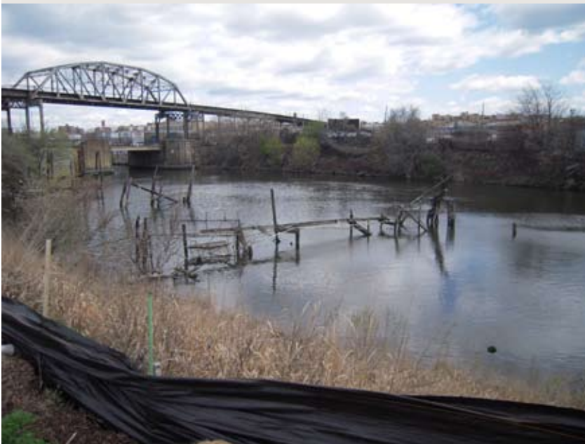
View of Bronx River near Hunts Point