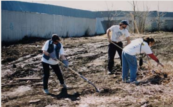
Neighbors begin clean up of Park site

The first cleanups began in the fall of 1998 and, according to Carter, the looming deadline of the "Golden Ball" event scheduled for Spring 1999 pushed the pace of the cleanup through the winter. There are few photographs of the site from that period, but all accounts indicate that it was a highly degraded space, with large-scale and heavy refuse from industrial and marine uses (such as huge links of anchor chains). The community received support for the cleanup from industrial neighbors as well as city agencies.