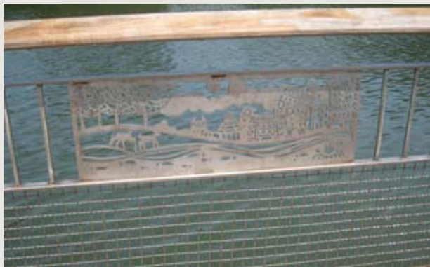
Detail of railing at dock

There are also ambitious ideas for adding value to the market in several ways, perhaps not directly caused by Hunts Point Park, but supported and reinforced by its success. Currently, the market is open only to wholesale buyers. There are plans to add retail operations in the Fulton Fish Market and other purveyors' shops, creating a destination site for local residents and visitors. There are reported to have even been very preliminary discussions about the potential for creating working piers for the Fulton Fish Market that would bring commercial fishermen down the Bronx River for the first time in over a century.